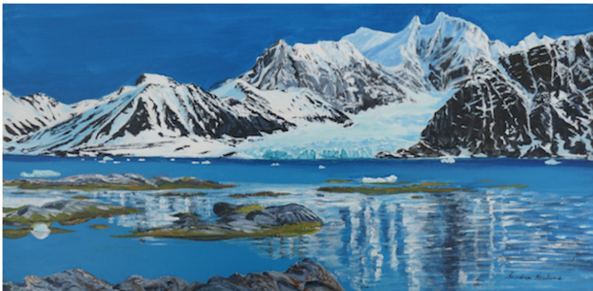
Glacier Samarinbreen. Mountain Hornsundtind, 1431 m, Acrylic 12”h x 24”w, by c. Sandra Hawkins

Maps : www.toposvalbard.npolar.no Wind systems: www.windy.com